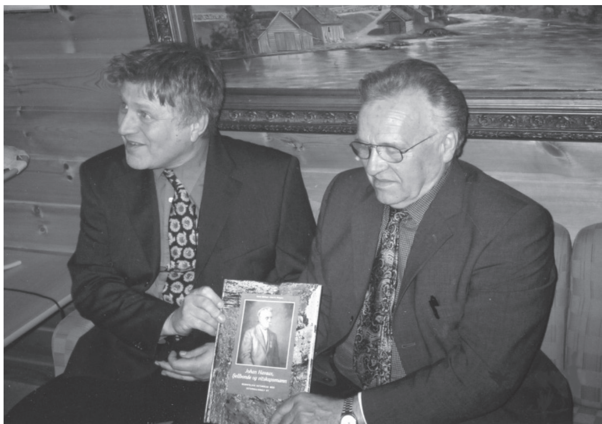
Launching of the new book.